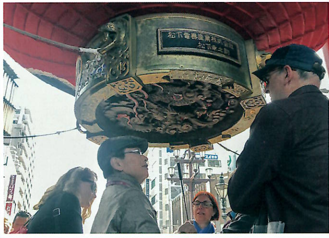
The huge lantern at Kaminarimon Gate in Sensoji Temple