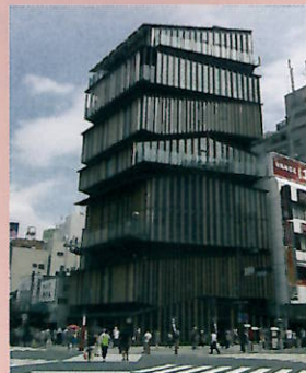
Asakusa Culture Tourist Information Center

To participate in a tour, please come to the TOKYO SGG CLUB counter on the first floor of Asakusa Culture Tourist Information Center, located across from the well-known Kaminarimon Gate of Sensoji Temple, as indicated on the map below. Please arrive 10 minutes before either scheduled starting time.