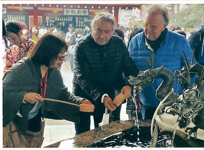
The water basin for purification in Sensoji Temple

Asakusa, one of the most traditional and lively neighborhoods in Tokyo, is waiting for your visit.