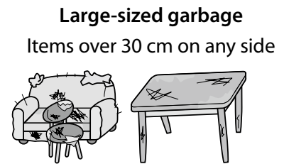
Picked up on a reservation basis