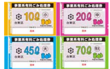
Taito City Business-Related Garbage Disposal Tickets

(Roughly up to three 45-liter garbage bags.)