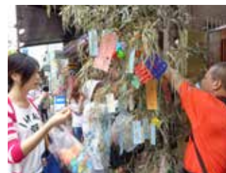
Tanabata experience at the Japanese-language class

The Taito City website posts various information for foreign residents.